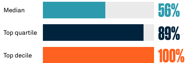
Chart is for illustrative purposes only. Past performance is not necessarily an indication of future performance.