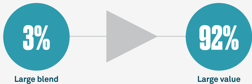
Median active manager beating its index over a 3-year period 1

However, this view may overlook opportunities in areas of the large cap equity universe where active management has been more effective. Large cap value, in particular, tells a different story. Our analysis suggests that active managers have consistently delivered in this space, with the median manager outperforming the Russell 1000 Value Index 92% of the time after fees over the same three-year period. 1